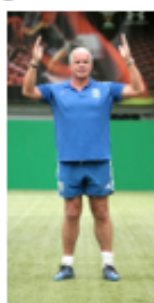
ICL & equipment required