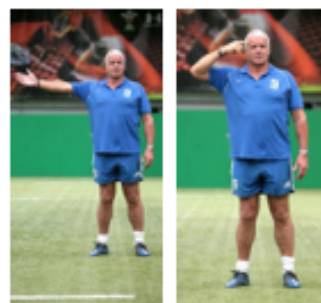
HIA required (above action x3)

HIA and blood injuries are to be assessed and treated in the medical room HIA for this match is a maximum of 13 mins long & player cannot return to the pitch for 10 mins Hawkeye equipment is located